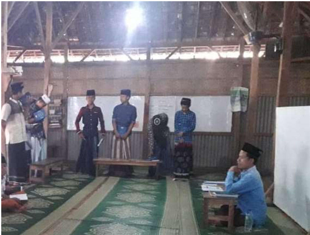
Figure 1. Teaching Materials

To clarify the process, the following is an overview of the assisted field: