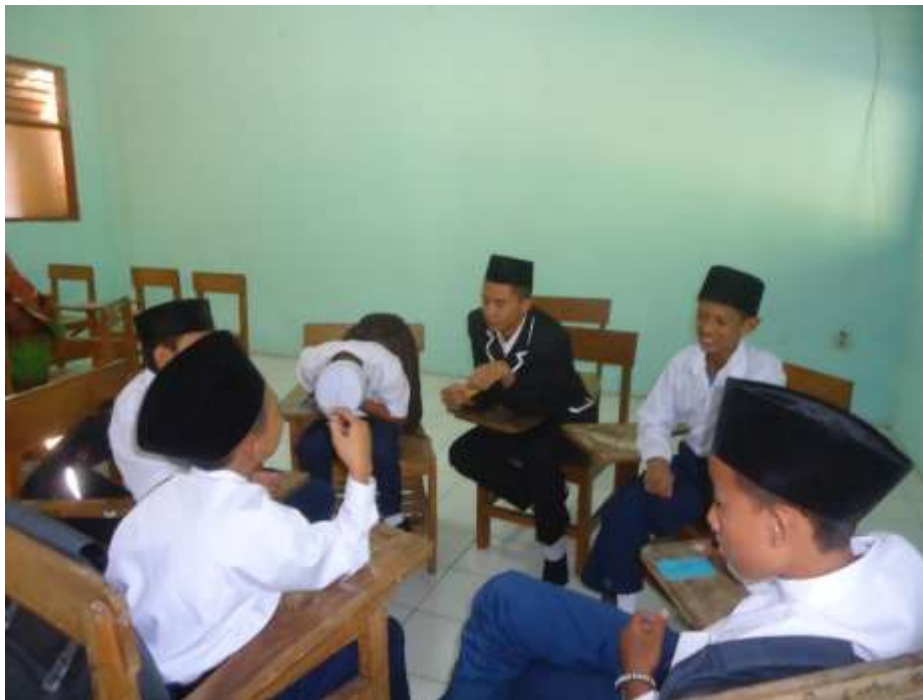
Figure 3. Student Response

Some of The community service activity that have been carried out are socialization of class activities, ways of using applications, presenting material in Arabic speaking, practice and evaluation or assessment.