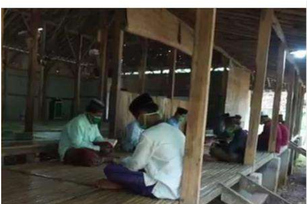
Figure 1. Teaching Materials The presentation steps in general are as follows:

fi adabi hamalati al-Qur'an which requires standard Arabic grammar. From previously not being able to see the structure of the sentence as a whole, after the assistance was able to do an analysis and study of the contents of the book from the aspect of grammar and text messages. To clarify the process, the following is an overview of the assisted field: