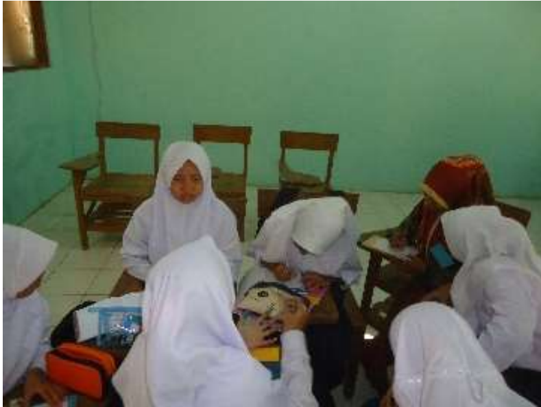
Figure 1. Material Submission

Canva application. Arabic writing materials presented through Canva are designed in such a way that learning is fun, effective and efficient.