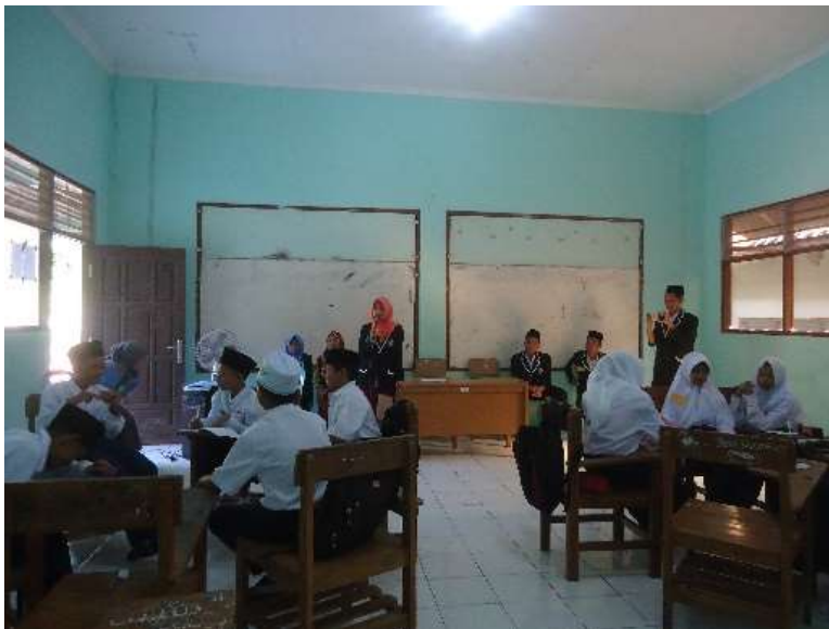
Figure 5. Student Response

The Arabic writing material presented is about material being studied by class IX junior high school students, namely 1) introducing myself or introducing self-identity, 2) greeting or greeting, 3) descriptive text about oneself and so on. The speaker has presented these materials in a presentation using the Canva application. Students are able to respond to any given exercises.