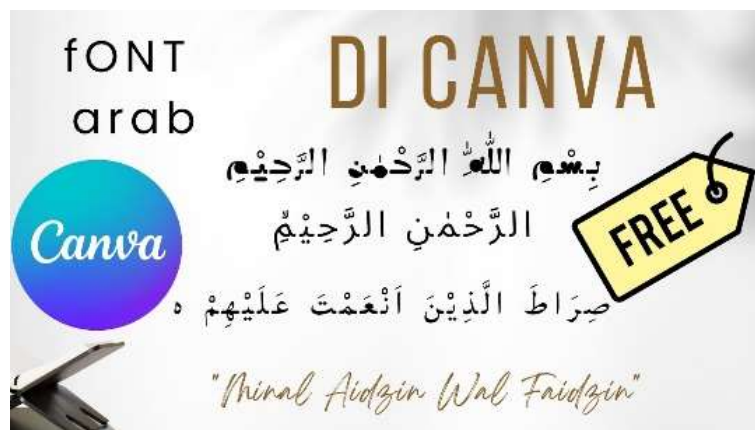
Figure 2. Arabic Writing Material

Pkm activities have been carried out in stages. The first activity is delivering Arabic writing material with the topic ta'aruf an alnafs or introducing identity using Canva. The next stage, participants have learned to use Canva. The material presented by Canva is in the form of Arabic writing skill activities such as listening, speaking, reading and writing. Pkm activity participants can easily use the CANVA application on their respective Android phones or Smartphones.